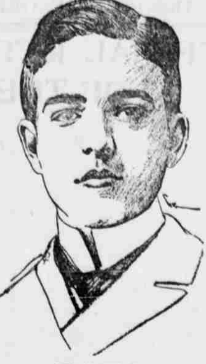
KING MANUEL II.

The New King of Portugal. With the accession of King Manuel II. to the throne of Portugal, the youngest reigning monarch of them all took his place among the crowned heads of Europe. The new king was the second son of the murdered Carlos and heir to the throne through the assassination of his elder and only brother, Crown Prince Luis. The youthful king was born in Lisbon on Nov. 15, 1889, and is therefore but a few months past his eighteenth