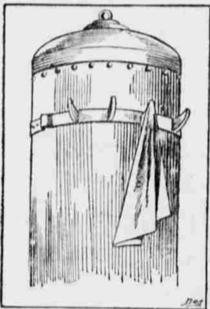
FOR DRYING TOWELS.

In the average kitchen there are never to be found enough dry towels when the process of dishwashing is at hand. The towel that ought to be ready for