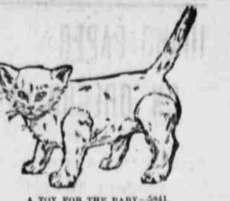
A TOY FOR THE BABY—541

MODES OF THE MOMENT. An Odd Pony Skin Coat—Quaint Bonnets For Woe Folk. More odd than pretty is a pony skin coat in short mandarin style cut in one piece and trimmed with colored bead banding, the kind that is worked on a loom. The crude effect is modified by veiling the trimming with black chiffon, while narrow chiffon bags in close tassels made from beads match in the decoration. The general style of winter hat runs smoothly to width. It is short in front, scoops down akin to a five in