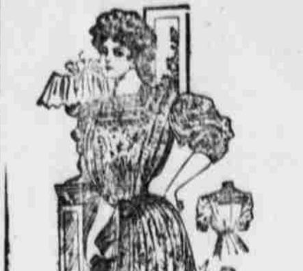
A Dainty Flowered Net—5725, 5726, 5727, 5728.

Fan Rubbers for the Fastidious Girl. White Parasols Trying on Eyes. Auto regulations include the long pongee silk coat, generally made of pongee in the natural or tan color. As a touch to modify this monotone, hoods, collars and cuffs of tuxan plaids are being used of similar materials, result.