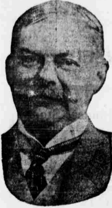
THOMAS NELSON PAGE.

Mr. Page is still in the prime of life, being only fifty-four. He is of course a native Virginian. Most of his literary work is strictly of the Virginia flavor. Mr. Page now lives in Wash-