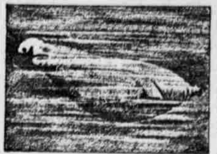
SPECIMEN OF SEA ELEPHANT.

One of the curiosities in the great private museum of natural history maintained by the Hon. Lionel Walter Rothschild in Tring Park, England, is a sea elephant, or elephant seal. Its scientific name is seal Macrorhinus elephantinus or proboscideus . It is the