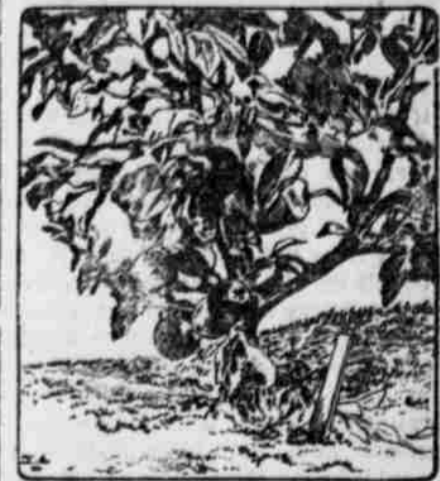
DWARF APPLE TREE IN FRUIT. (The kind they grow in Massachusetts.)