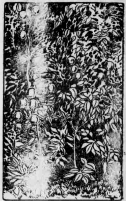
APPLES IN UPRIGHT CORDONS. (As grown at Massachusetts Agricultural college.)

The apple adapts itself admirably to horizontal cordons. Dwarf apples require practically the same cultivation and care as standard apples. The soil should be cultivated the early part of the summer and allowed to rest the latter part of the year. Cover crops may be sown during June or July, ac-