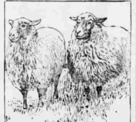
HIGH CLASS TUNIS SHEEP.

They have cleaner noses and less tagging than any other sheep. They are hustlers and will make their own living if it can be found. They are