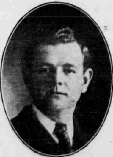
DEMOCRATIC NOMINEE Representative in Congress.