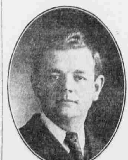
DEMOCRATIC NOMINEE Representative in Congress.