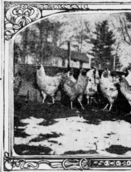
WHITE AND BARRED PLYMOUTH ROCKS AT BILTMORE, N. C.

and stock of all kinds, the presence of which always enriches and fertilizes the soil, providing that care and attention be given to the economical saving of the manure and a proper distribution of it over the land. The States of Missouri, Kansas and California are samples of what can be done in the upbuilding of the poultry interests for the elevation of its people through an increased income enabling the State to have better schools, better education, better homes, and to better improve their lands. Only a short time since there