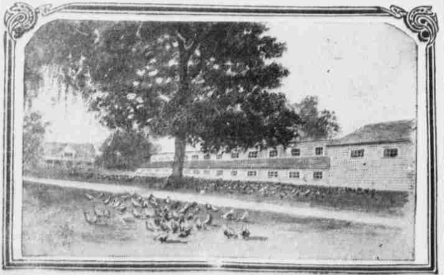
A MISSISSIPPI POULTRY RANCH.

If these matters were earnestly taken hold of by the agricultural departments in every Southern State and pushed as they should be, with a