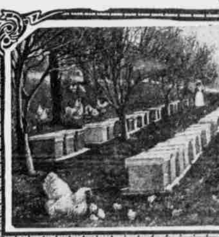
POULTRY, BEES AND FRUIT ON A SOUTHERN FARM.

a study of the effect of the presence of the male bird on egg fertility. Forty Leghorn hens which had previously been kept without males were placed