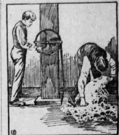
HAND SHEARING MACHINE.