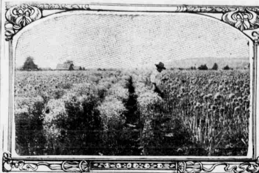
SEED LETTUCE AND ONIONS IN HEAD

abolishes a system whereby the Congressmen who want to keep in touch with his constituents has an opportunity to mail out a little package of garden seeds to his entire list of voters, he cheerfully votes against the measure and instead votes for an appropriation of over a quarter of a million of dollars a year for free garden and flower seeds. If somebody would introduce a bill, even with this big appropriation, but specifying that the Secretary of Agriculture should expend the money in procuring and distributing only such seeds and