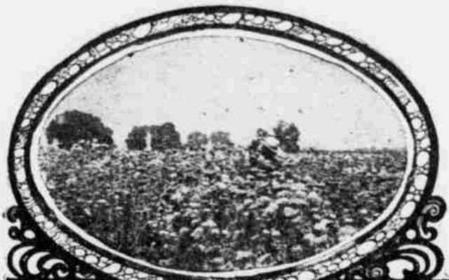
A Field of Seed Lettuce. Parsnip Growing For Seed. California Scenes.

It isn't made with a scissors and a paste pot. There's good "grey matter" goes into every page of it. There's human sympathy in every line of it. There's originality and genuine good hard common sense all through it. It don't under take to tell you how to be happy on a million a year, but it does tell you how to be happy on the modest income that so many millions live on who don't have a million a year to spend. And the magazine costs 10c. for One Whole Year---That's All And it's worth ten dollars for its good suggestions about life and health and homemaking. Send your dime or five two-cent stamps to MAXWELL'S HOMEMAKER MAGAZINE, 1409 Fisher Building, CHICAGO.