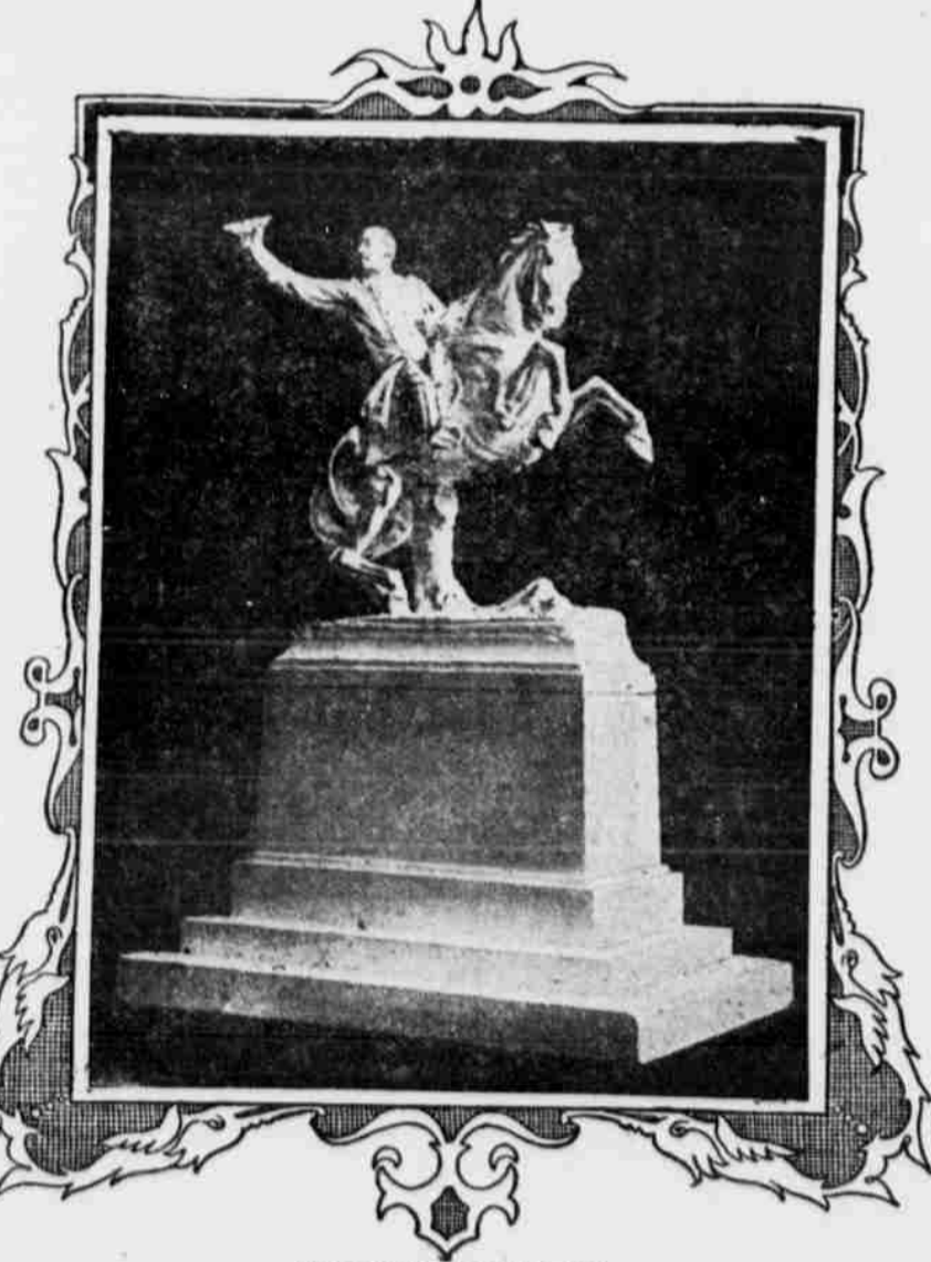
THE SHERIDAN STATUE.

There came a day when the supply ceased to suffice. Periods of unusual and protracted drought followed each other for a number of