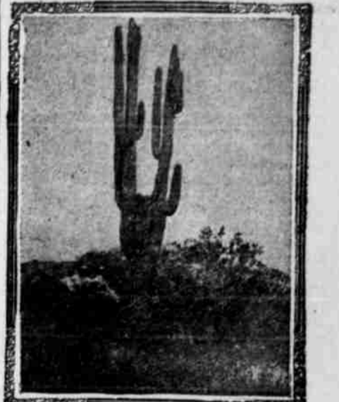
GIANT CACTUS OF THE SALT RIVER VALLEY.

years. Thousands of acres of vines and orchards perished miserably and the desert once more began to encroach upon the cultivated fields. With a courage born of experience with arid conditions, a sublime faith in their chosen field, the people bravely tried to meet misfortunes and to overcome them. It was a hopeless struggle. Salvation, though near, was just out of reach. The great floods which came each year, sweeping away bridges and tearing out canals and ditches, could not be utilized because