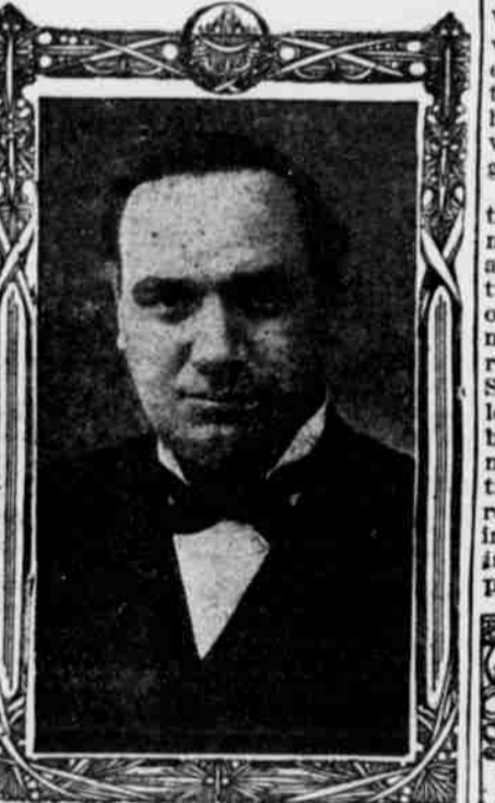
SENATOR ELMER J. BURKETT, of Nebraska.

The opposition, however, did not develop any great amount of strength, and Mr. Burkett was unanimously declared the choice of the Republicans of the state for Senator, to succeed Sena-