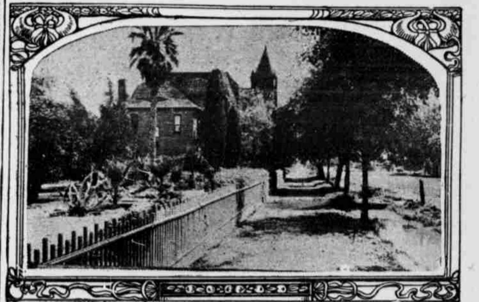
SCENE IN PHOENIX, ARIZONA.

Once Lair of Geronimo's Apaches. Far up in the San Francisco Mountains, once the rendezvous of the Apache outlaw Geronimo, and his band of murderers, Salt River and Tonto Creek come together in Tonto Basin and flow into a deep and narrow canyon. Near the entrance to this gorge the Engineers of the Reclamation Service are building the Roosevelt dam, one of the highest in the world. From bedrock to top it will be 275 feet high, or about half the height of Washington monument. It will be of rubble masonry, and in its construction will require 220,000 bbls. of cement. When completed it will store 1,400,000 acre feet of water, or sufficient water to cover that many acres one foot deep. Once full, it will insure sufficient water to cover 200,000 acres in the valley with five feet of water, the amount needed to produce a full crop. The people are pledged to pay $3,000,000 in ten years for this work. To-day only 100,000 acres are irrigated under present sys-