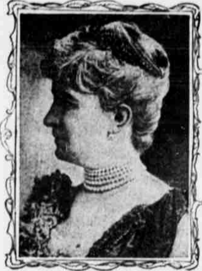
MRS. POTTER PALMER.

Mrs. Potter Palmer, however, is a woman whose social position is assured and has been for a number of years. To know her is the open sesame to the most exclusive houses in America, and so when she went abroad last summer and announced her intention of staying for the re-