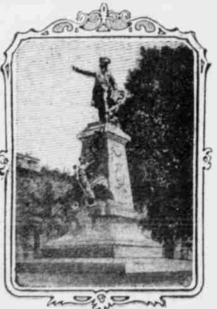
ROCHAMBEAU STATUE. Stands Opposite the White House.

One of the very striking and majestic bits of bronze in Washington is the Rochambeau statue which stands in what was called Jackson Square,