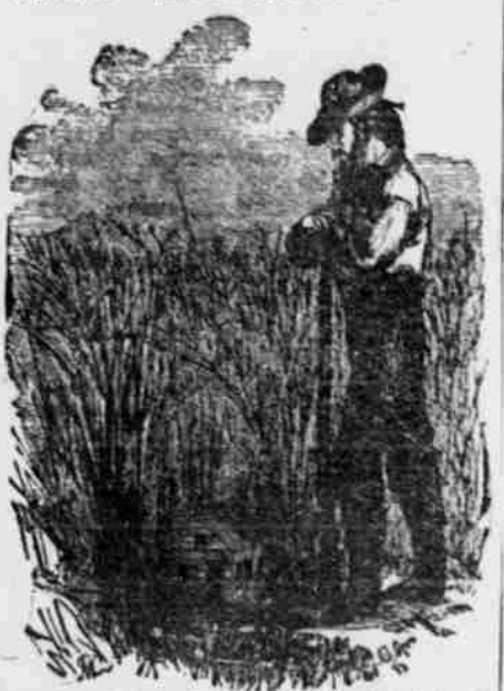
From an old wood-cut illustration in Richardson's "West of the Mississippi."—A "Home" 14x20 (inches, not feet) showing that false swearing in acquiring government land is no new art.

seen in various degrees of dilapidation, but they show no evidence of genuine occupation. They have never been in any sense homes. Investigations have been carried on where the commuted homesteads are notable in number. The records of some of the counties examined show that 90 per cent of the commuted homesteads were transferred within three months after acquisition of title, and evidence was obtained to show that two-thirds of the commuted homesteads were immediately left to the state. In many instances foreigners, particularly citizens of Canada, came into this country, declared their intention of becoming citizens, took up homesteads, commuted, sold them and returned to their native land. The reasons given for adhering to the commutation clause are diverse and many of them are cogent when applied to individual cases. It is said, for example, that the commutator desires to raise money for use in improving his place. This is often true, but in the majority of cases the records show that the commutator immediately leaves the vicinity. The frequency of loans is traceable in many places directly to the activity of agents of loan companies, who are often United States commissioners also, eager first to induce settlement and then to make these loans on account of the double commission received. Later they secure the business which accrues to them