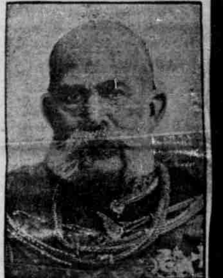
EMPEROR FRANCIS JOSEPH.

Louis Kossuth died in 1894 in Italy. He had lived in that country during the later years of his life, although by the amnesty of 1867 he might have returned to his native land. Francis Kossuth was a civil engineer in Italy when the call came to him soon after his father's death to go to Hungary take a seat in the Hungarian parliament and lead the party which the elder Kossuth had once led. He responded to the call, gave up his Italian citizenship and on arrival in Bucharest was the recipient of many honors. In outlining the policy upon which he had determined he said he would hold fast to his father's principles, but would seek another way toward their realization. He declared in favor of working for the economic in-