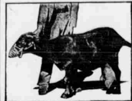
SPANISH MILCH GOAT

Among the various European milch goats the Spanish goat is said to be foremost in the quantity and quality of milk given. The accompanying illustration is from a photograph taken by Explorer David G. Fairchild, of the Department of Agricul-