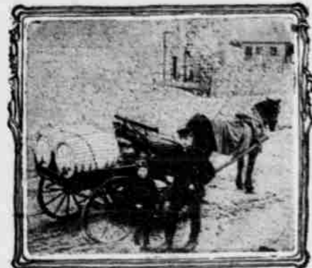
SELLING MILK IN DENMARK

A bee, carrying no burden, will fly at the rate of forty miles an hour. Carrying a load of honey his speed is reduced to about twelve miles.