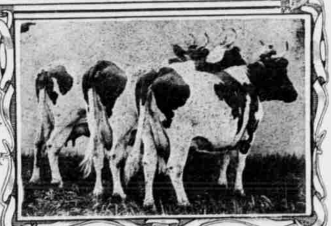
Danish Prize Winners.

Brittany, in the north of France, has within its borders pretty, active little black-and-white cattle with marked dairy characteristics, producing often an astounding quantity of milk for their size, but they are believed to be useful in the United States only as playthings.