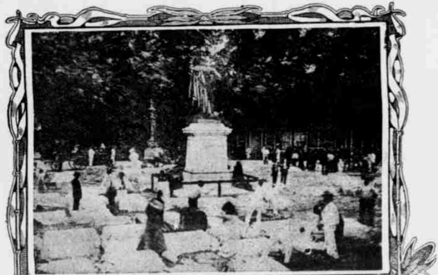
Holland Cheese Market.