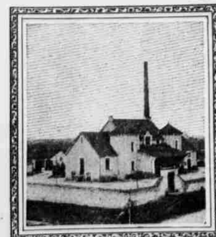
MODEL CO-OPERATIVE FRENCH CREAMERY

farmer and dairymen are making as rapid strides forward as can be found anywhere.