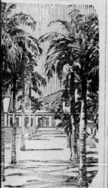
Entrance to Philippine Exhibit, at Lewis & Clark Centennial.