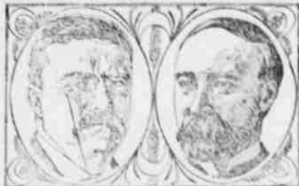
ROOSEVELT AND FAIRBANKS.