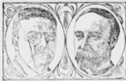
ROOSEVELT AND FAIRBANKS.