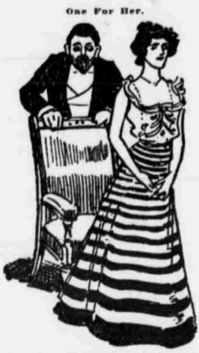
One For Her. She—it must be a terrible shock to a woman when a man proposes. He—it must be a bigger shock when he doesn't propose.