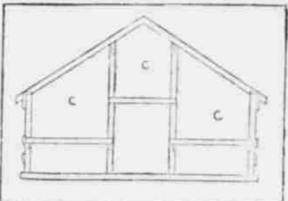
Fig. 2 shows a section of the middle bents. C C C shows spaces where corn

can be stored. Make the posts out of 2 by 6 joists doubled, putting in two center bents only. Use 2 by 4 nailing strips. Plates are formed of a 2 by 6 and a 2 by 8 joist put together. Rafters, 2 by 4; sill, 8 by 8 timbers.