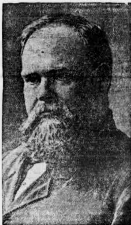
EX-GOVERNOR HOGG OF TEXAS.

Since the first discovery of oil in Beaumont ex-Governor Hogg has been the most picturesque figure in the field.