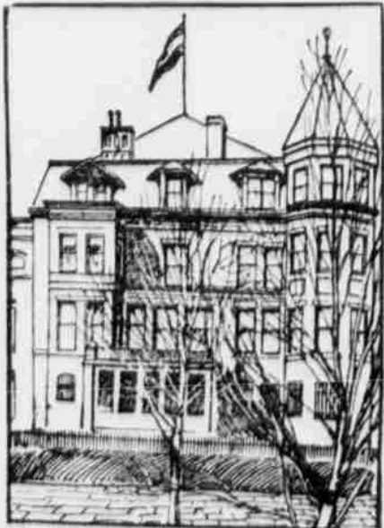
THE GERMAN EMBASSY, WASHINGTON.

But I am longing for the day When I no more need fear The dreadful price which I must pay When firewood is so dear; When from the spigot that I turn The water freely flows, When I no more in grief shall learn That everything is froze. —Washington Star.