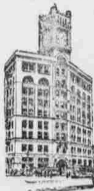
The Chronicle Building.

Including postage to any part of the United States, Canada and Mexico. THE WEEKLY CHRONICLE, the brightest and most complete Weekly Newspaper in the World, prints regularly 112 Columns, or 8,500 Pages, of News, Literature and General Information; also a magnificent Agricultural and Horticultural Department. This is one of the greatest departments in any paper on the Coast. Everything written is based on experience in the Coast States, and on Eastern men's knowledge of their own localities. SAMPLE COPY SENT FREE.