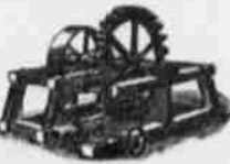
THE PELTON WHEEL.

THE PELTON WATER WHEEL COMPANY, 127 Tenth St., San Francisco, Cal., U.S.A. 143 Liberty St., New York, N.Y., U.S.A.