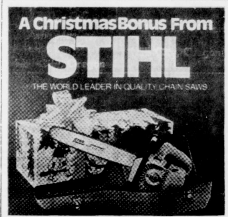
STIHL 015 With Electronic Ignition

Maps for sale under the new system will include recreation maps of the 19 National Forests in Oregon and Washington; the following Wilderover the years along with cost Eagle Cap, Glacier Peak, Goat of producing them, and it has Rocks, Kalmlopsis, Mt. Hood, become difficult to satisfy the Mt. Jefferson, Mt. Washington, and Three Sisters; and one Regional Forester T. A. special topographic map -