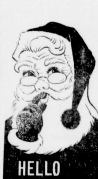
May Santa bring you many things and joy and peace surround you.