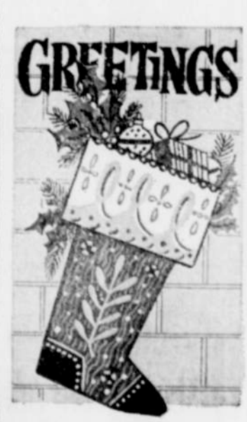
May your stocking be filled, your heart be warmed with all the joys of Christmas.

Thurs., January 9 Thurs., January 15 Mon., January 26 Thurs., February 5 Kennedy Thurs., Feb. 12 Salem Academy Mon., February 16 Mon., Feb. 23 . . Colton AWAY GAMES Mon., January 12 Kennedy Thurs., Jan. 19 Salem Academy Thurs., January 22 Thurs., January 29 Mon., February 2 Mon., February 9 Thurs., February 19