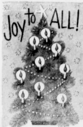
Christmas cheer in full measure to friends and patrons. Thank you for letting us serve all of you during the past year.

Riddle of the week: Why is the figure 9 like a peacock? Because without a tail it is nothing.