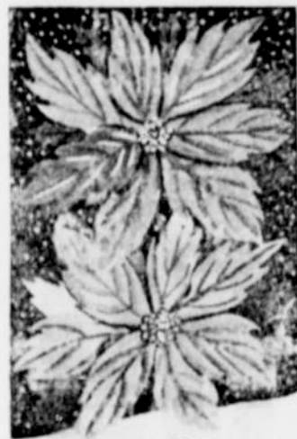
Please accept our sincere thanks for your valued friendship and patronage.