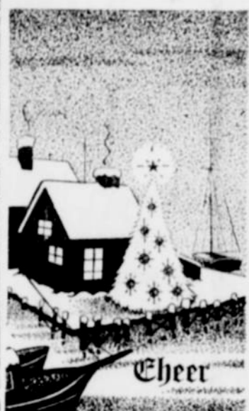
In the spirit of the season, we say, "Thanks" to all our friends and customers.