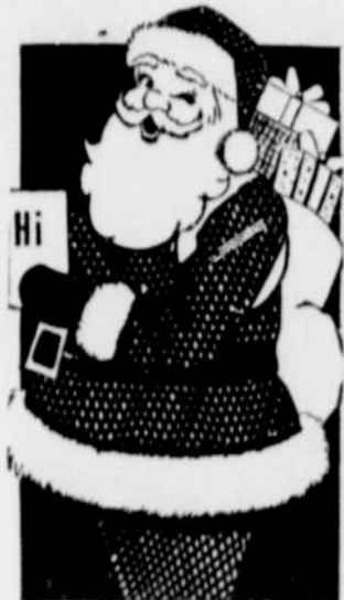
Hi Just Want to Say "Merry Christmas to You!"