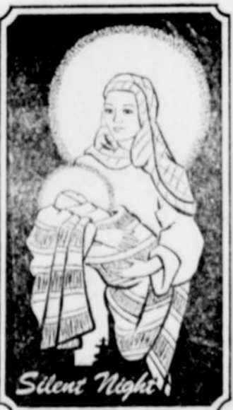
May the true joy of Bethlehem warm the hearts of all our friends and neighbors.