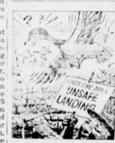
needs your help too!