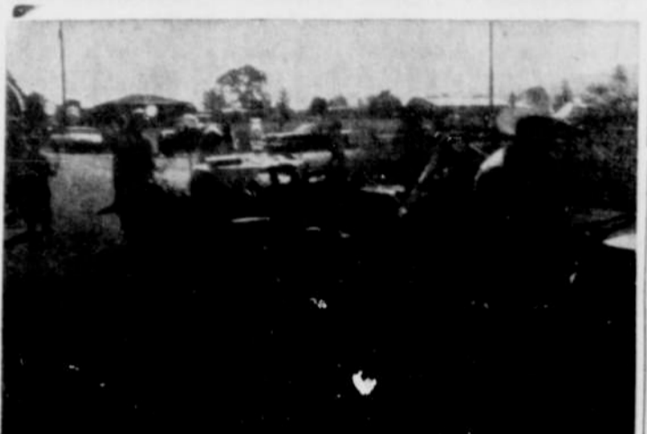
Another entry in the Lyons Bi-Centennial Parade.