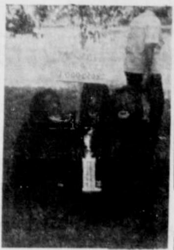
Adding to the amusement of onlookers before and during the parade were these three unidentifiable gorillas.