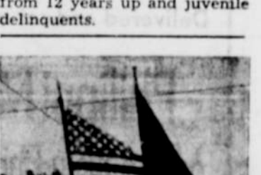
Color Guard in the parade was from Lebanon National Guard unit.