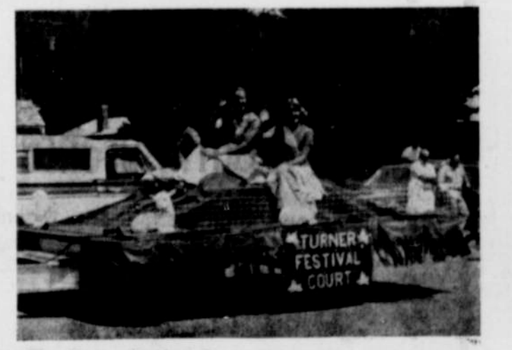
The Turner Festival Court was a crowd pleaser and won third in the youth division.