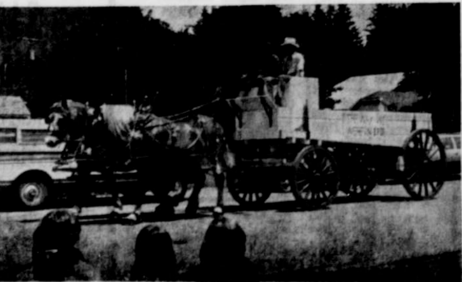
A unique entry in the parade was this horse and wagon entry.