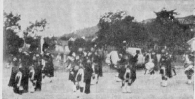
An entertaining and colorful marching unit was the Eugene Highlanders whose bagpipe music was enjoyed by all during the parade and during the afternoon.