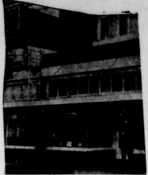
our readers of this Pictorial Business Review. They wish to take this opportunity to thank past business and are looking forward to serving them again.

The products offered by this firm are the best quality to be found and includes floor coverings, Frigidaire appliances, Wilson sporting goods, guns, ammunition, Dutch Boy Paints, and Kitchenaid dishwashers. We suggest them to all of