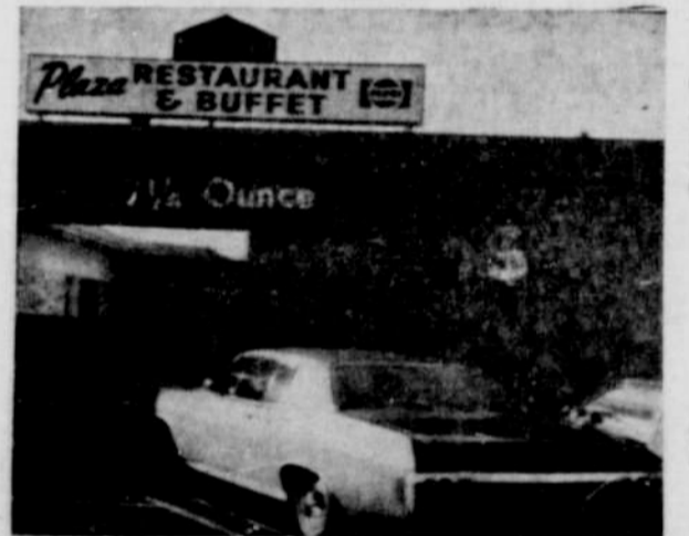
their good food and friendly service. They feature family style smorgasbord and children's plates. They are open at 6:00 a.m. to 8:00 p.m. daily except Wednesday.

We, the editing staff of this business Review, wish to point out this fine restaurant for