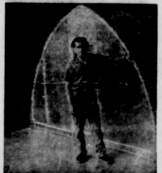
gon 97374. There is no other greenhouse that will measure up to a MACO. When you own a MACO . . . you own the best . . . for less. Don't delay, write today, and find out how practical and versatile the MACO Greenhouse is to own.

For more information, call 394-3621, or write to MACO Products, Box 100, Scio, Ore-