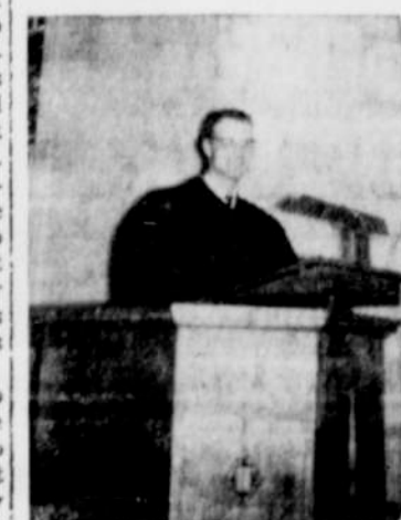
company picture was taken. He has been pastor of the First Presbyterian church in Bellingham, Wn. for the past six years.