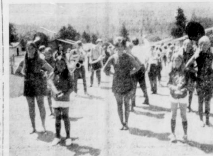
The fast stepping Santiam Wolverettes and All School Band added color and spirit to the parade.