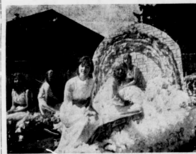
The Rainbow for Girls float won first place in the youth division. The girls put in a lot of work getting their float ready for the parade.