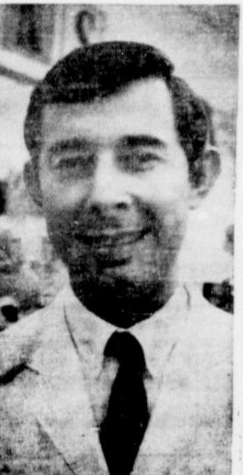
By Frank Stromquist

• Transplantation of islets of Langerhans—small cellular masses necessary for the secretion of insulin—may one day improve the condition of many diabetics. Recent experimentation in rats, indicate the transplant procedure is feasible, though complicated and results in a significant modification of diabetes. Many questions still remain about human transplants, but at present this technique seems more encouraging than the transplanting of an entire pancreas. Human pancreatic transplants have been tried 24 times, and all have failed. • There is something fishy about the current mercury scare, or so two recent studies suggest. At the very least, argues one, there is nothing new about mercury concentrations in the ocean. Experiments with fish preserved in museums show that there is no significant difference in mercury concentration between tuna caught 93 years ago and tuna just off the boat. • A new danger in the taking of LSD has been revealed by a physician D. A. E. Inglis. His report in a national surgeon's magazine indicates the possibility that the drug constricts the blood vessels of the hands and feet severely enough to cause gangrene.