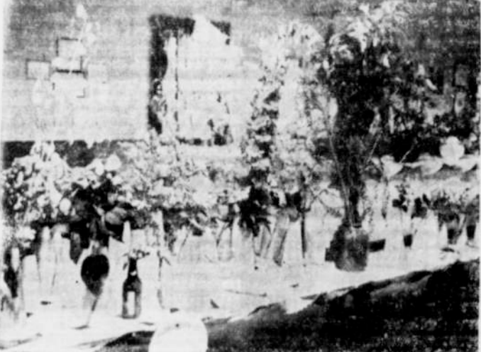
The above pictures were taken Saturday afternoon at the Santiam Grange Fair Lyons. The top photo shows the horn of plenty—theme of the fair was harvest of plenty. The middle photo is the display of horticultural exhibits and the bottom photo shows some of the vegetable display.

have been living in the house next to the Post Office, moved to Lyons last week.