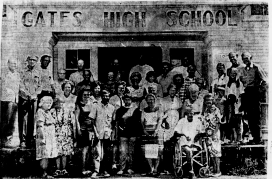
Pictured above are those attending the Gates High School Reunion which was held Sunday at the old Gates High School.