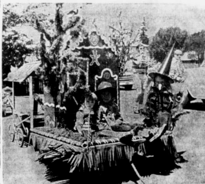
Grand Sweepstakes winner in the Kiddie division of the parade was this float depicting Gingerbread House.