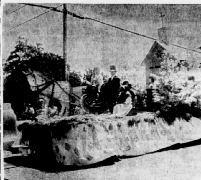
This Float won first place in the Adult division of the parade. It was entered by the First Christian Church.