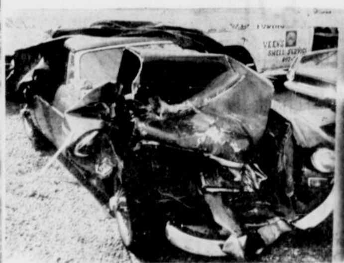
Four Hurt in Two-Car Crash