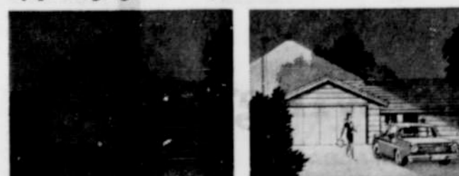
Light Guard can mean the difference between night and day on your property

Light Guard bathes your property in warm, glare-free light. And light is the last thing prowlers need. Ask any policeman! What's more, Light Guard gives you more productive time for your farm or business, especially during dark winter months. And Light Guard helps you avoid accidents, too, by putting light where you need it.