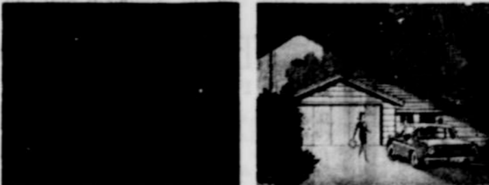
Light Guard can mean the difference between night and day on your property

What's more, Light Guard gives you more productive time for your farm or business, especially during dark winter months. And Light Guard helps you avoid accidents, too, by putting light where you need it.