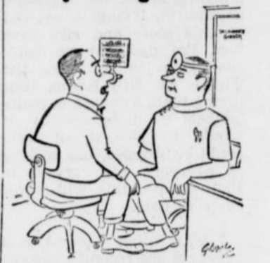
"Our bandmaster thinks I need glasses."