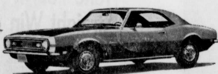
Camaro SS Sport Coupe