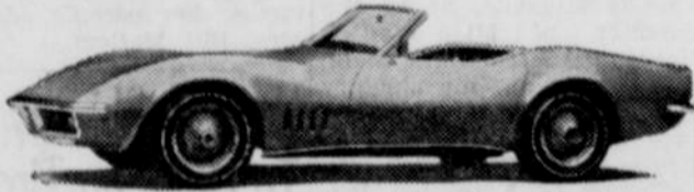
Corvette Sting Ray Convertible

out. You'll appreciate all the proved safety features on the '68 Chevrolets, including the GM-developed energy-absorbing steering column and many new ones. More style. More performance. More all-around value. One look tells you these are for the man who loves driving. One demonstration drive shows why!