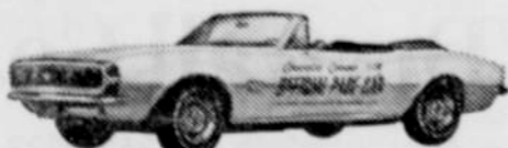
CAMARO CHOSEN 1967 INDIANAPOLIS 500 PACE CAR

Now, during the sale, the special hood stripe and floor-mounted shift for the 3-speed transmission are available at no extra cost! See your Chevrolet dealer now and save!