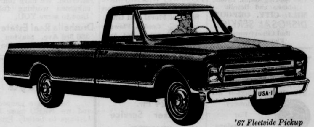
'67 Fleetside Pickup

Its new look is just one nice thing about the '67 Chevy pickup