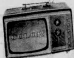
1967 Model GE Porta-Color TV

Miss Salem Universe invites you to the Grand Opening of our Salem office of Columbian Optical in the New Salem Plaza and to register for the Free Prize Drawing.