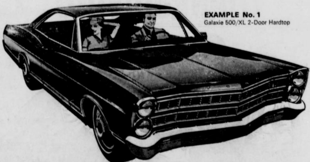
EXAMPLE No. 1 Galaxie 500/XL 2-Door Hardtop

Your Ford Dealer can show you 47 ways to redecorate your garage.