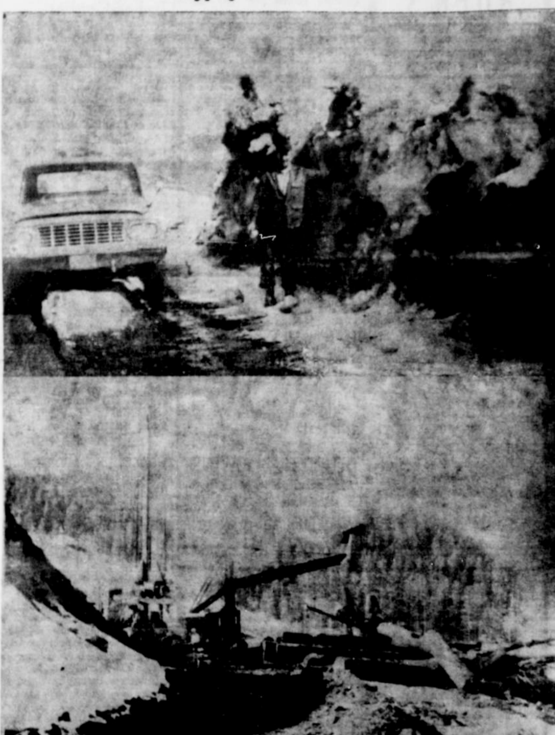
H & W Logging Crews At Work In Snow

Santiam PTA is the sponsoring organization.