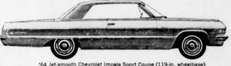
'64 Jet-smooth Chevrolet Impala Sport Coupe (119-in. wheelbase)