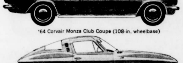
'64 Corvair Monza Club Coupe (108-in. wheelbase)