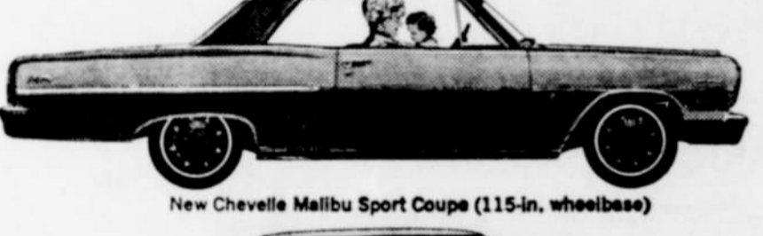
New Chevelle Malibu Sport Coupe (115-in. wheelbase)